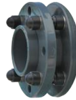
Double Flange Connections with Screws