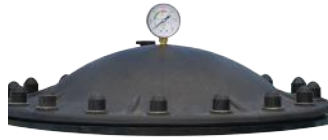
Fiberglass Reinforced Filter Lid