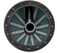
40 cm Large Lid Opening