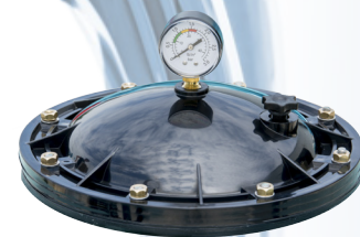
ABS Filter Lid