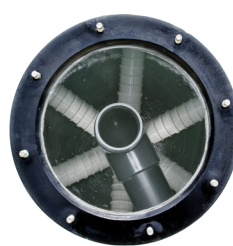
ABS Collector Arms