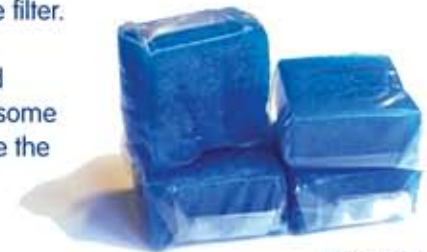
70gm and commercial brickette

Clear Flock Gel should not be used with cartridge filters.