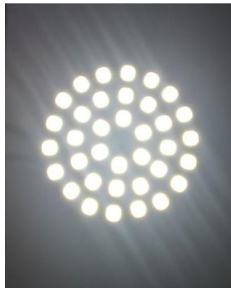
SMD 36 Led Mini Bulbs without Glass